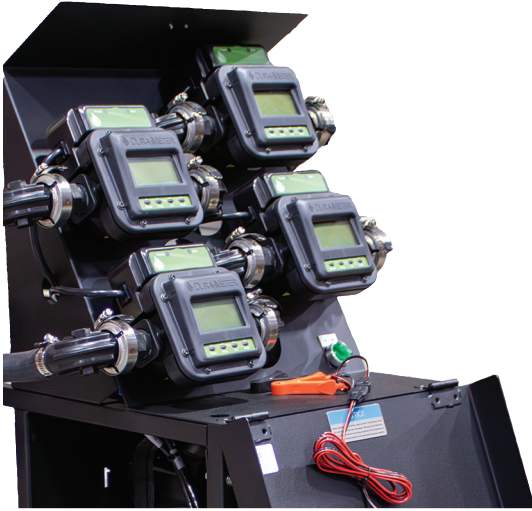
Built-in Shelf Under Meters