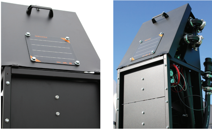
Protective Meter Lid & Solar Panel