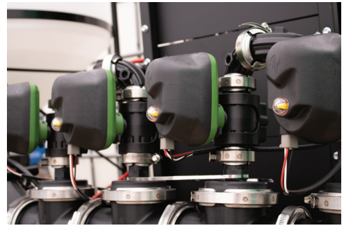
Dura 1" Electric Valves