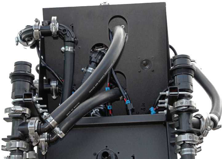
Dry Poppet Calibration Connections